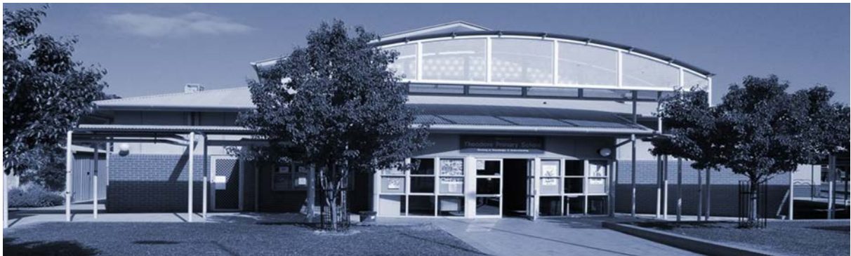
Theodore Primary School Hall